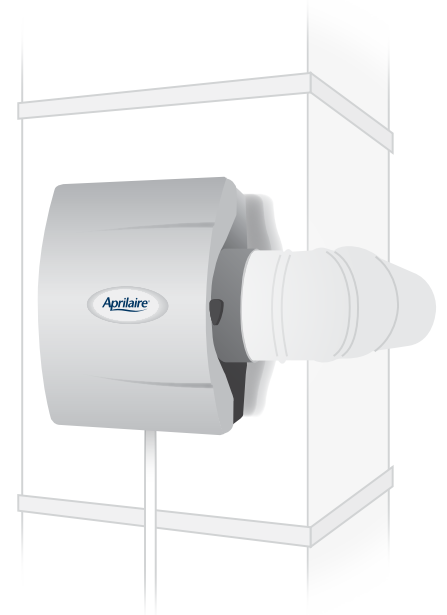
Bypass model shown. We will recommend the right model for your system.

Dry air can make your home both uncomfortable and unhealthy. Aprilaire whole-home humidifiers can help. They are installed as part of your home's heating and cooling system and automatically deliver the perfect amount of humidified air, not just to one room, but throughout every room of your home.